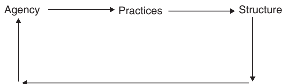
Fig. 17.1 Relation between Agency, Practices, and Structure

The basic argument of Giddens’ structuration theory can be expressed in the diagram in Fig. 17.1 (below). The routine practices of everyday life reproduce